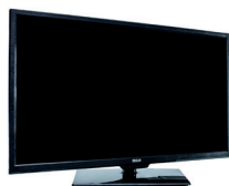
Swivel Base Design