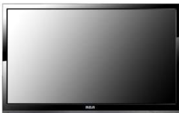
Bezel Design for 28", 32", 42" Models

Note: Features and specifications are subject to change without notice.